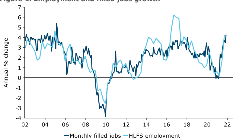
Figure 1. Employment and filled jobs growth