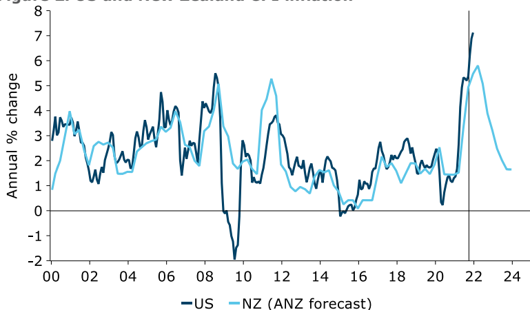
Figure 2. US and New Zealand CPI inflation